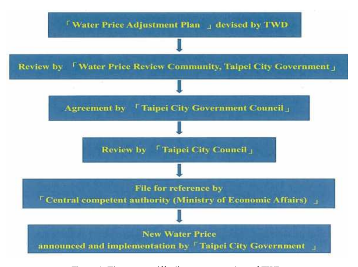
Figure 1. The water tariff adjustment procedure of TWD

The water tariff adjustment procedure of TWD is shown in Figure 1. The water tariff adjustment plan is devised by TWD first, and send to the Taipei City Government Water Price Review Committee for deliberation. After deliberation, it will be passed by the Taipei Municipal Government Council then deliver to the Taipei City Council for review and submit to the Ministry of Economic Affairs and has done the file for reference and assent. TWD will begin to charge the new water price standard after Taipei City Government declare the implementation date.